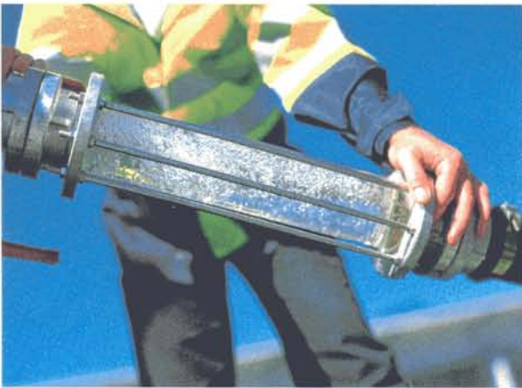
Fig. 2. Complex – An effective way to clean pipelines without chemicals.

to the higher water need in pipelines at a larger diameter cleaning is frequently only possible with the Complex process. This cleaning is however so efficient, that disinfection is not required in most cases.