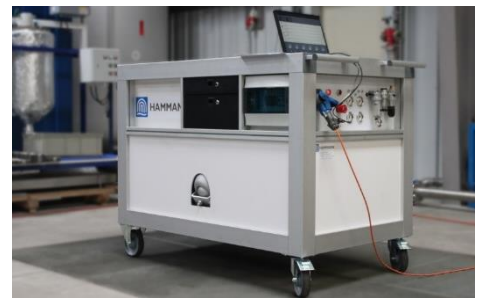
Figure 2: mobile Complex® Unit MCE III

„We ordered Hammann GmbH for the cleaning of tempering units and machining centers during their relocation into a new production building. Cleaning with the Complex-process has been performed professionally and to our fullest satisfaction. Therefore, our machinery is fully operational in its new environment for our future demands.“