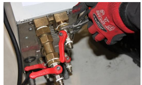
Figure 4: preparation of connections