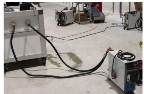
Figure 3: tempering unit during Complex® cleaning with MCE III