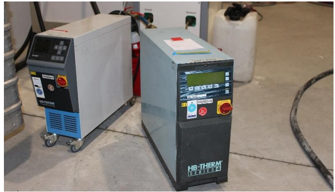
Figure 1: tempering units

Reference project Machine cooling Plastics processing