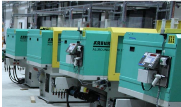
Figure 1: injection molding machines