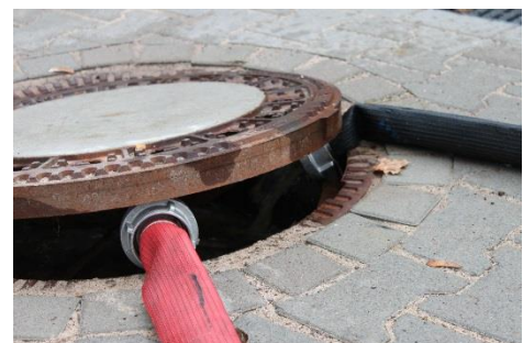
Figure 4: discharge into drain shaft