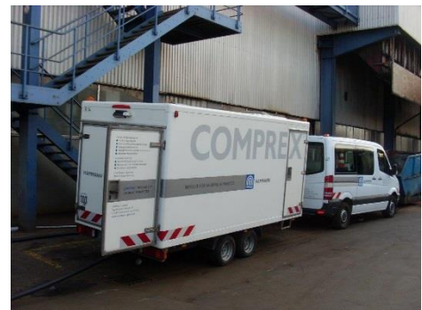
Figure 2: Comprex® unit