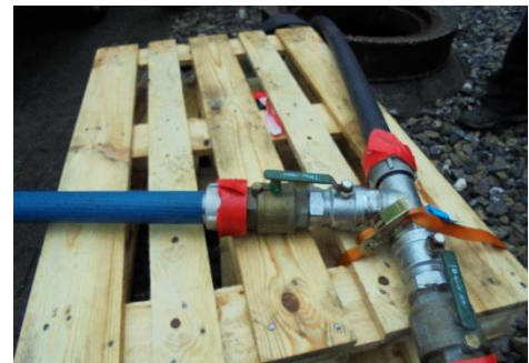
Figure 2: central feed of air and water into a shaft