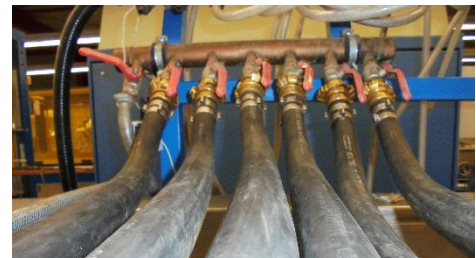
Figure 3: discharge via parallel connections