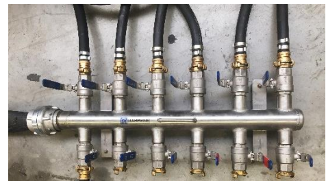
Figure 4: distributor for discharge