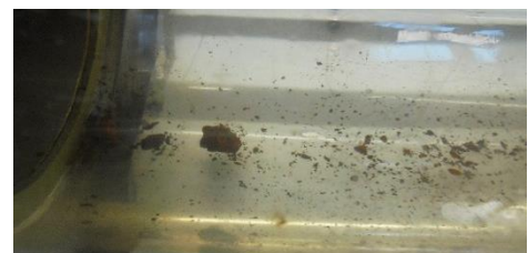
Figure 5: discharged coarse particles in inspection glass during cleaning