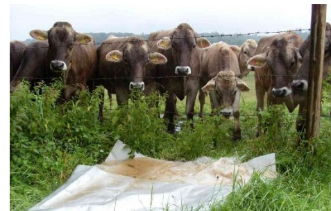
Figure 3: discharge location