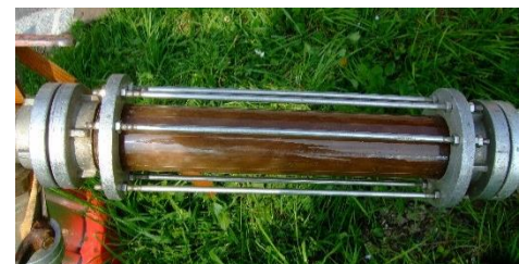
Figure 4: inspection glass during cleaning