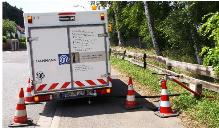
Figure 1: Comprex® equipment on site