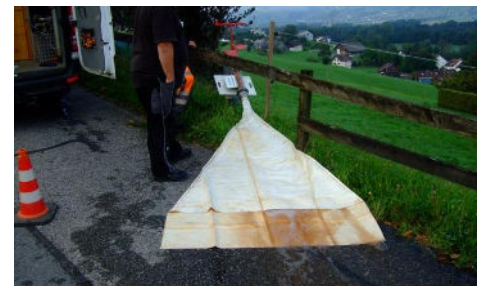
Figure 2: discharge bag