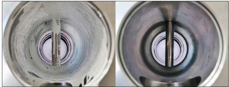
View of the plant section for emulsion paints before and after cleaning.

The Complex process works through the targeted use of compressed air pulses and water. The cleaning process saves time compared to the usual washing