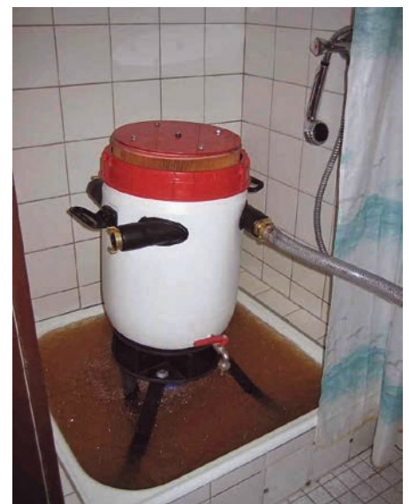
Hydrocyclone with filter for shower tray.