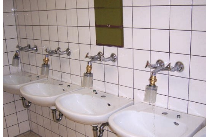
Tapping points with centrifugal separators.