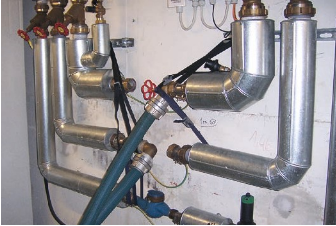
Compressed air supply via adapter.