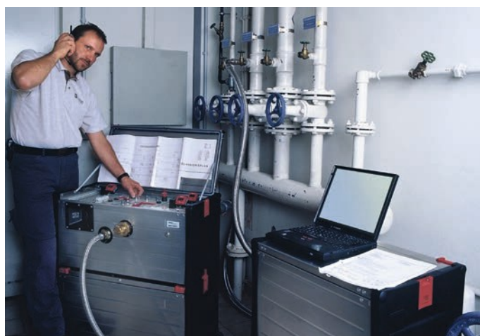
Compressed air supply to distributor.

Disinfection is often required in contaminated pipes. This is only effective if impurities and deposits have been removed. Disinfection with the minimum recommended disinfectant concentration and exposure time is then usually sufficient. The addition of inhibitors helps to reduce iron migration (re-ironing) in steel pipes after cleaning.