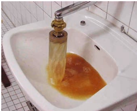
Centrifugal separator in action.

During systematic cleaning with the Complex process, cold and hot water lines are flushed individually. Normally, compressed air is injected into the manifold after the water meter. Sometimes it is necessary to remove components and connect the pressure hoses via adapters. At the tapping points