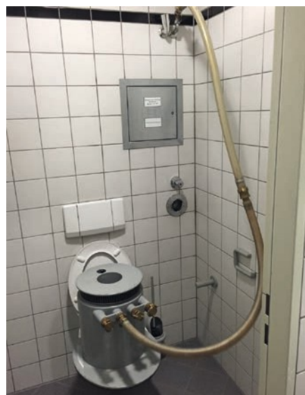
Hydrocyclone with filter for WC.

have the purpose of reducing the dwell times in ring pipes of drinking water installations. Deposits and biofilms can also form in these systems during operation, making cleaning necessary. The cleaning options were investigated in a test system using the network model developed by Hammann GmbH. The test facility contained various ring line variants for both floor and corridor distribution. The investigations at the test facility showed that neither water flushing nor classic flushing with water/air mixtures are sufficient. Only the Complex process is suitable for mobilizing and removing the model impurities. In principle, the previous flushing sequence from bottom to top has been confirmed. However, it is only necessary to clean one ring at a time in the case of ring pipes in the stockworks, while the other rings are closed. Always flush in the direction of flow and prevent the water from circulating in the ring pipes. These measures are necessary to prevent the backwashing of particles into sections that have already been cleaned.